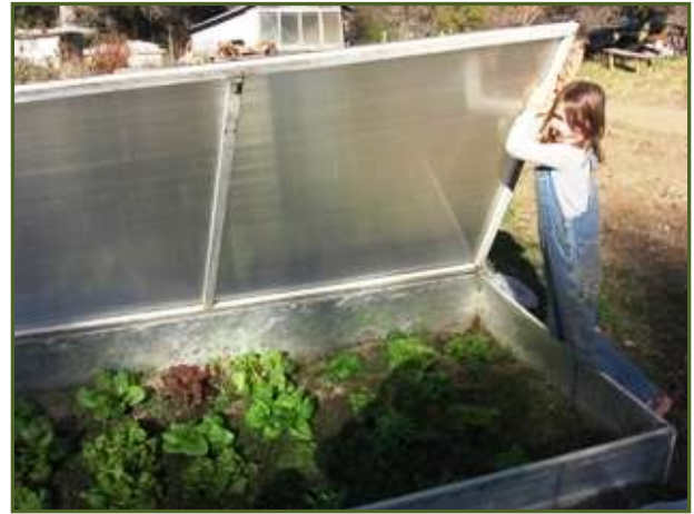
The farm is still producing a lot of food.