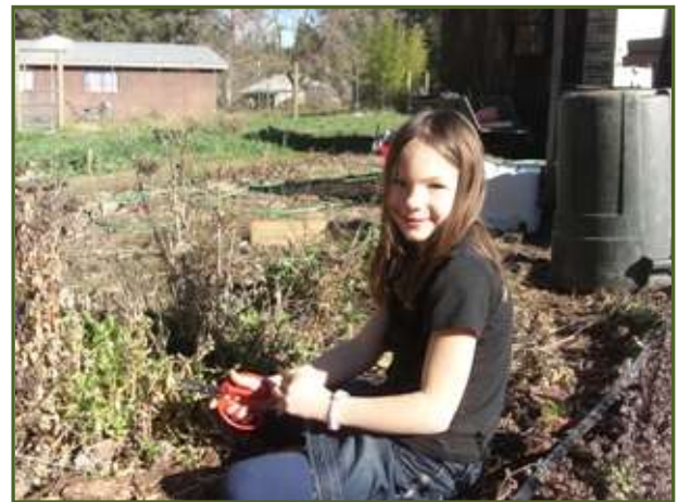
We cut back the flower bed in preparation for spring.