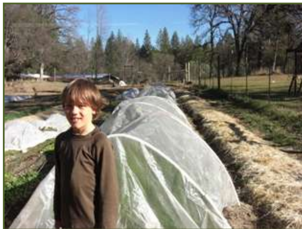
Row covers like these help protect the plants from freezing weather.

Our Home Study Farm Program is for Grades 1, 2 & 3 (ages 6-9). Classes meet on Mondays and Wednesdays at the Sierra Friends Center from 9 a.m. to 1:30 p.m.