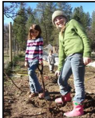
We planted fruit and nut trees in the Permaculture garden

Our Home Study Farm Program is for Grades 1, 2 & 3 (ages 6-9). Classes meet on Mondays and Wednesdays at the Sierra Friends Center from 9 a.m. to 1:30 p.m.