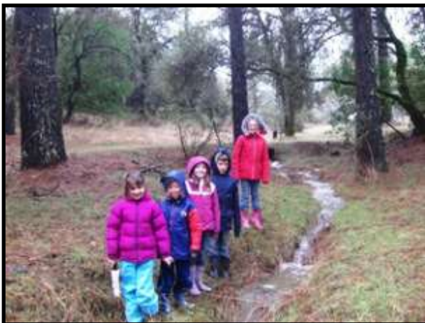
We went for a nature walk in the rain and noticed how much water there was