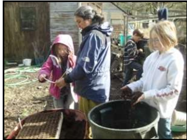
We started cabbage seeds in trays