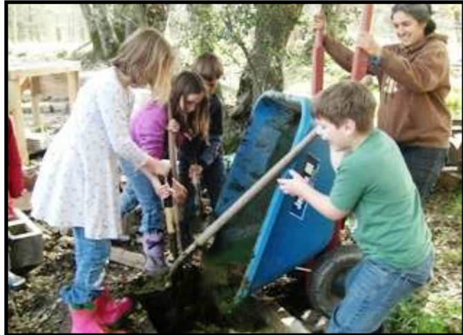
We made a Biodynamic preparation for the farm and put it in a pit to cure