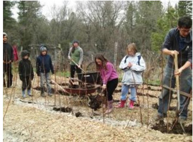
Fertilizing and mulching the raspberry bed.