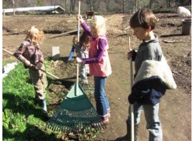
Raking up the chard we pruned to feed the compost