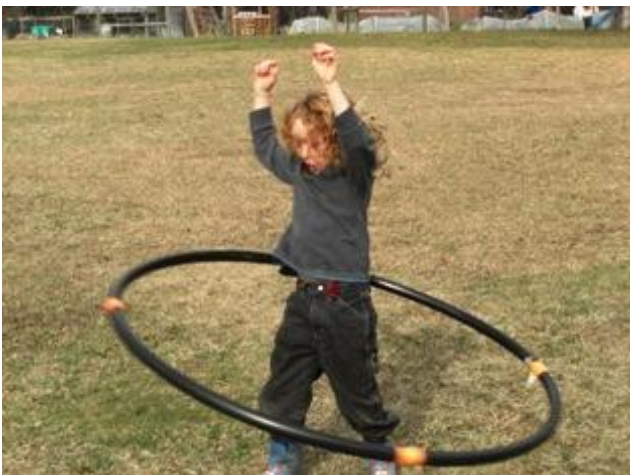
Hoolahoop in the field