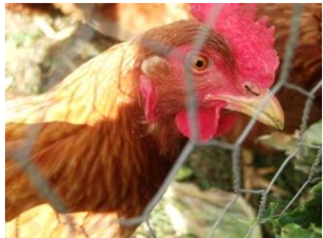
A local hen