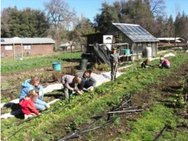
Weeding the spinach bed