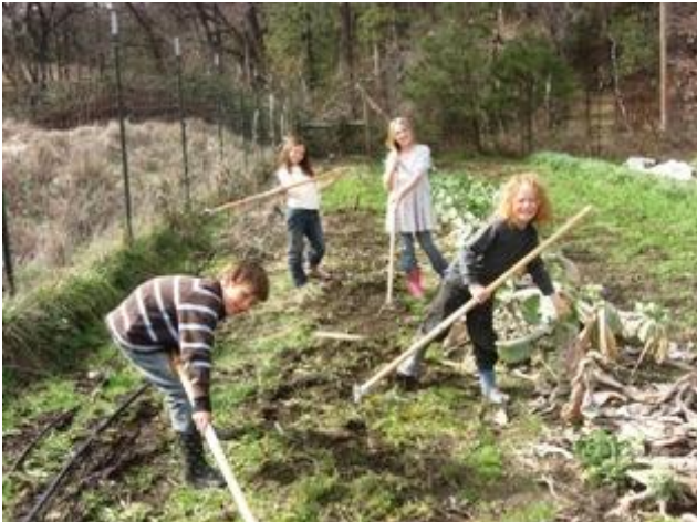
Preparing a over crop bed