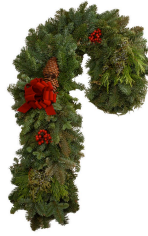
25" Candy Cane with Holly Berries