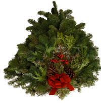
25" Swag With Holly Berries