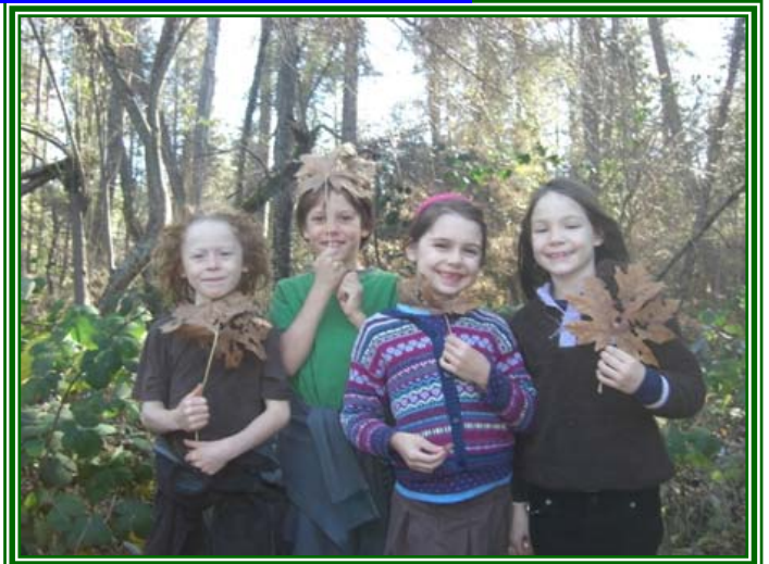
We went on a nature walk and looked at deciduous trees.