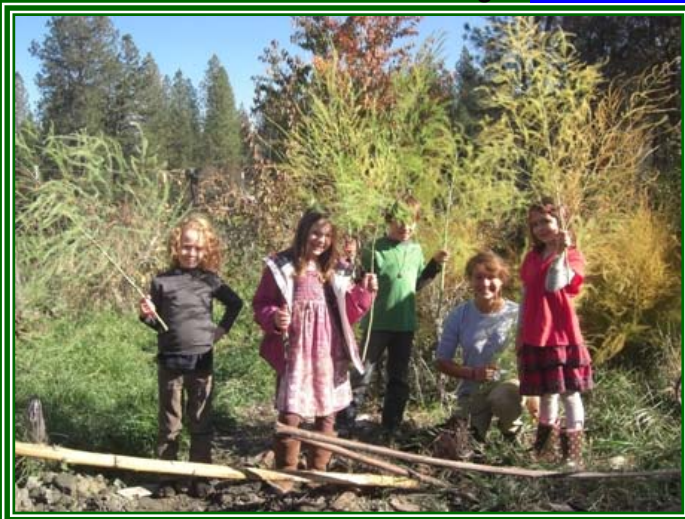
We cut back asparagus and thought they looked like Christmas trees.

See our new blog at http://yrcshomestudyfarmprogram.blogspot.com/